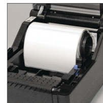
Drop-Load-Go Media Bin