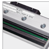
Easy Print Head Replacement